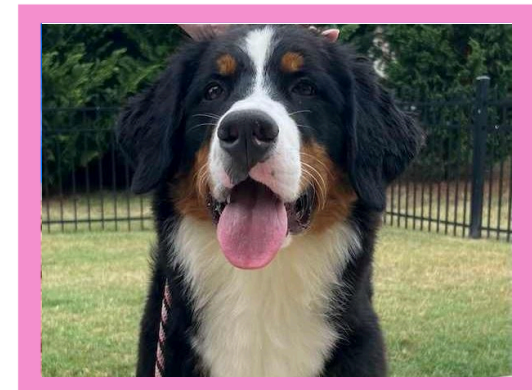
Country Belle (Bernese Mountain Dog)