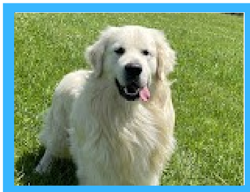
High Point Ranger Frisco (Golden Retriever)