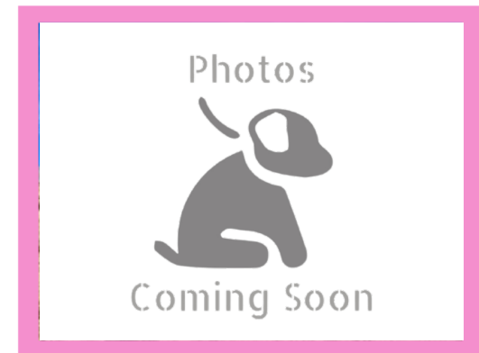
Brooke (Bernese Mountain Dog)